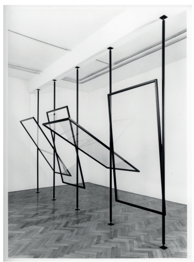
Gerhard Richter, 4 Panes of Glass, 1967 (Installation view Anthony d'Offay Gallery, Londen, 1991)